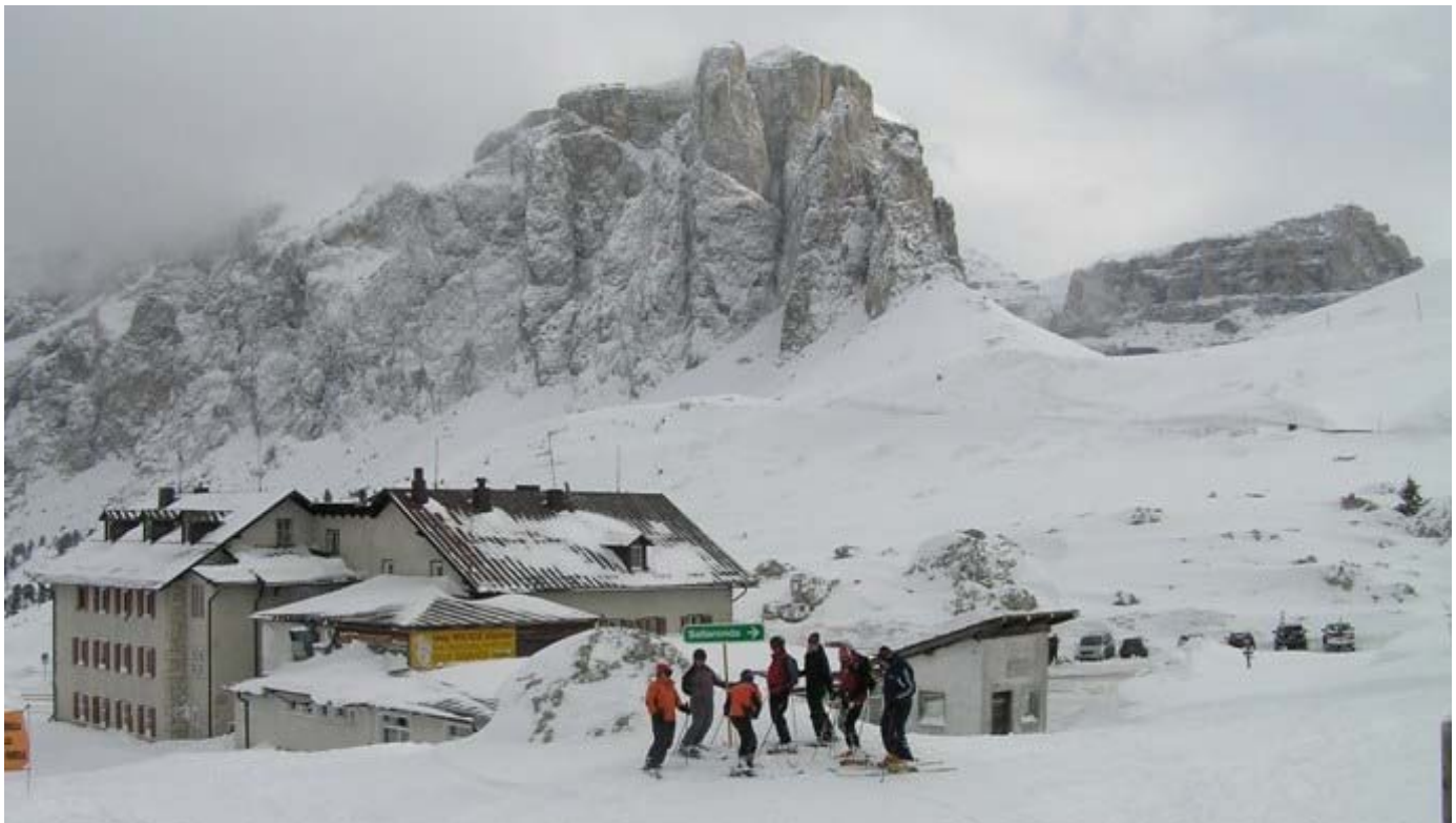
Just one of the adventures to be had with SKIBACS trips! Sellaronda, Dolomites, Italy