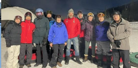
Tube Park pose