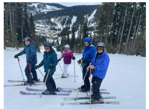
View of village from Morrisey