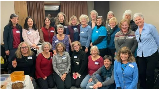
Club Social: Gals