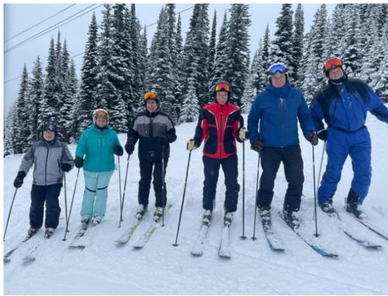
Enjoying powder day at Morrisey