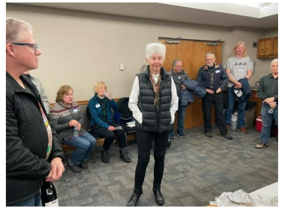
Olympic Champ Nancy Greene