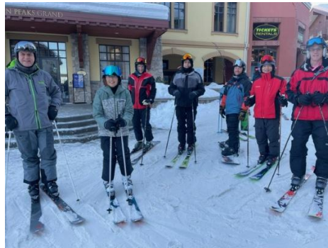
Day 1: Ready to ride 1 st lift