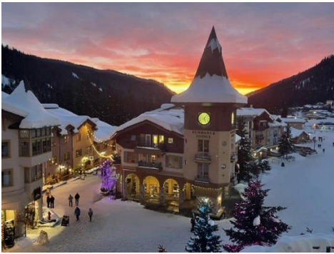
Sunset view of village from hotel