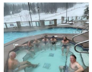
Slopeside hot tubs